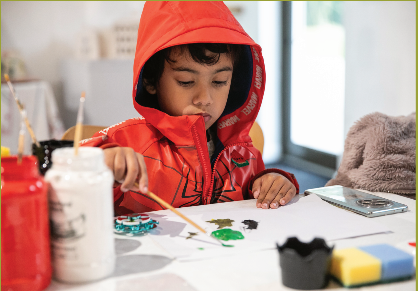
Arts and crafts at Soho House Museum.