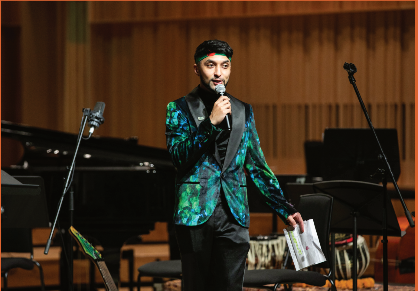
SMASH Bengali hosting the closing night of Bangla Week 2024 at the Royal Birmingham Conservatoire.