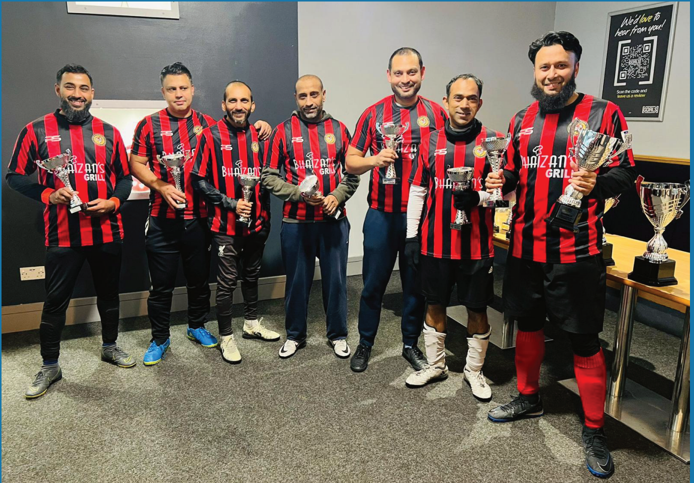
One of our Legacy 'Veterans' football teams celebrates another successful season.