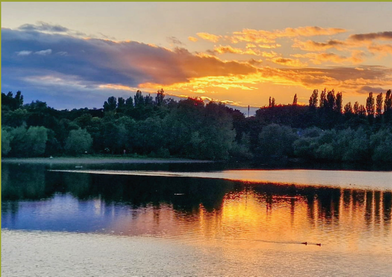
Edgbaston Reservoir, which plays host to Nowka Bais each year.