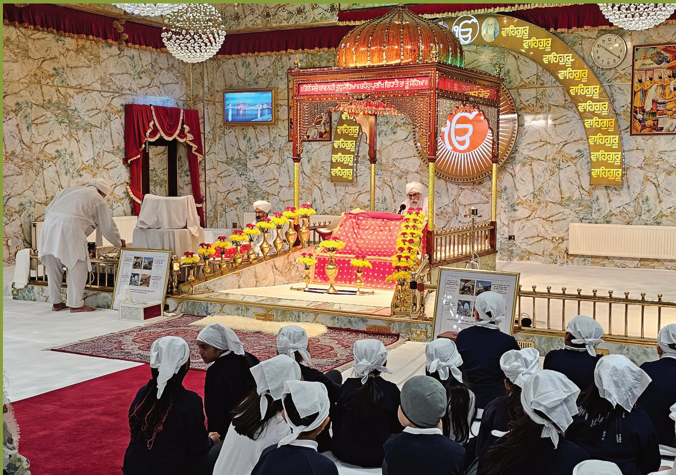
A guided tour of GNNSJ Gurdwara, Handsworth for St. Augustine's pupils.