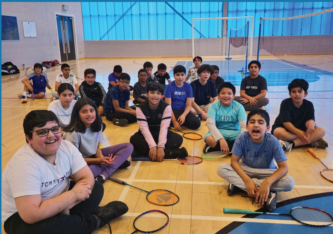
Kids' saturday badminton session.