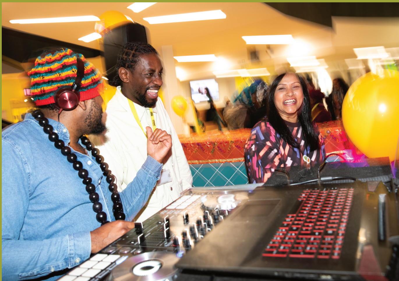
Poetry after Chai event celebrating Bangla Week 2024 at the Midlands Arts Centre.