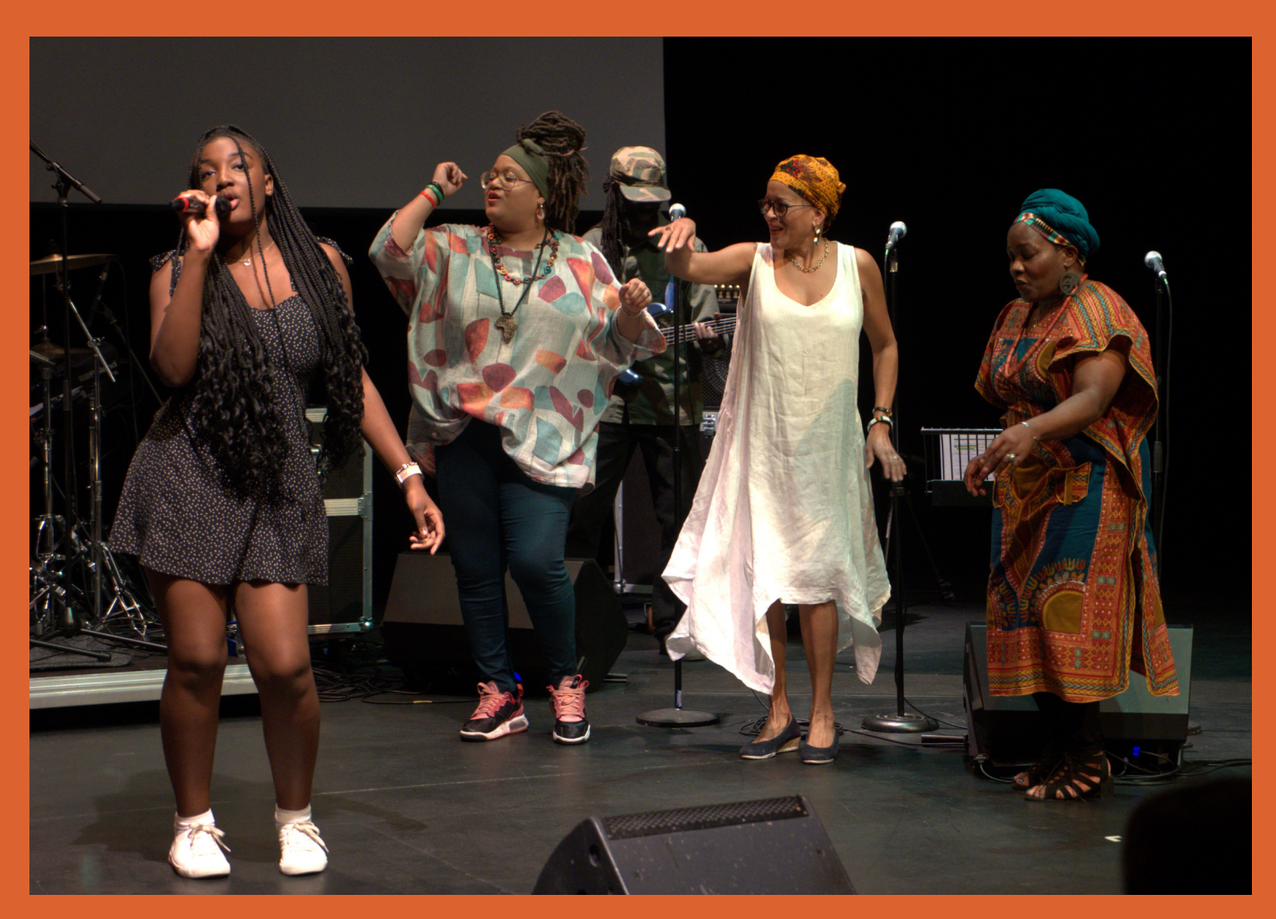
History of Reggae permformers at The Birmingham Rep theatre.