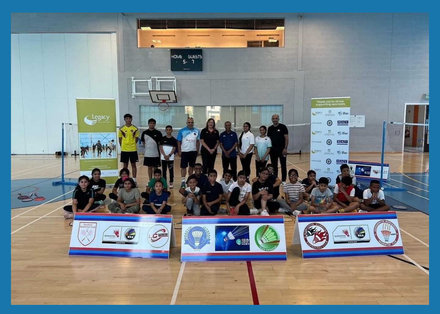
Kids badminton session meeting VIP guest Sue Storey, CEO of Badminton England.