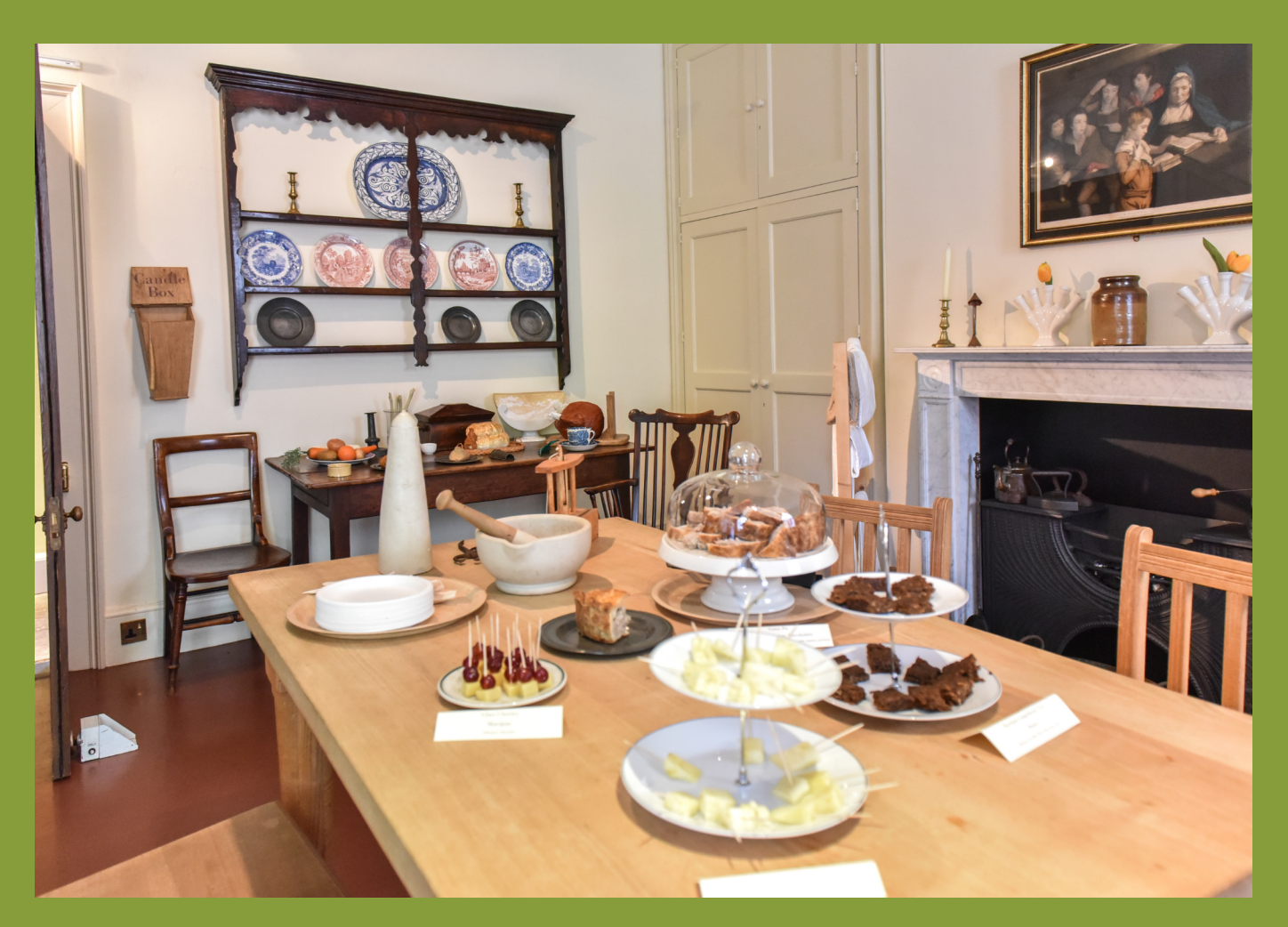
Georgian treats at Soho House Museum.