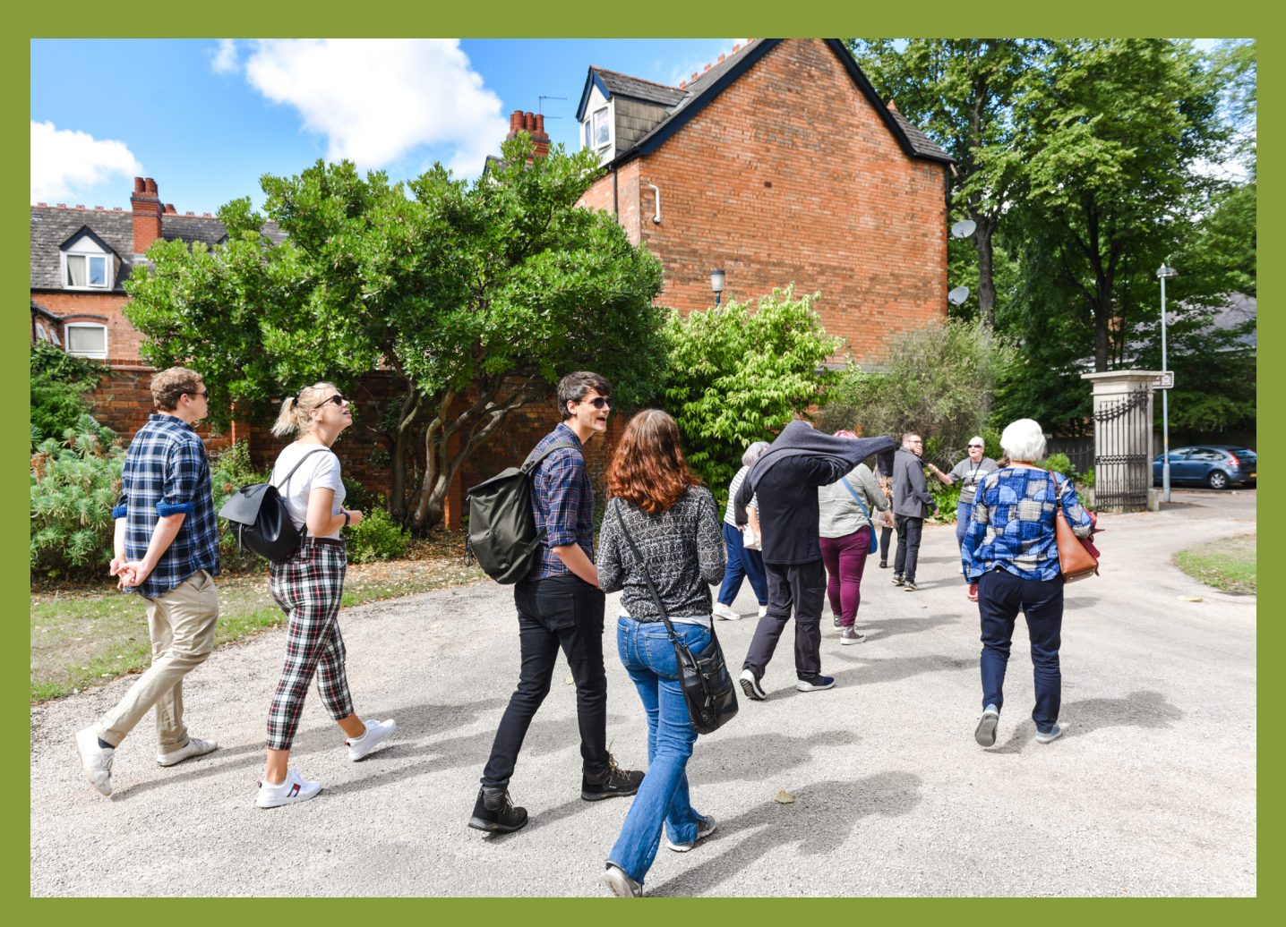
A Taste of Handsworth walking trail.