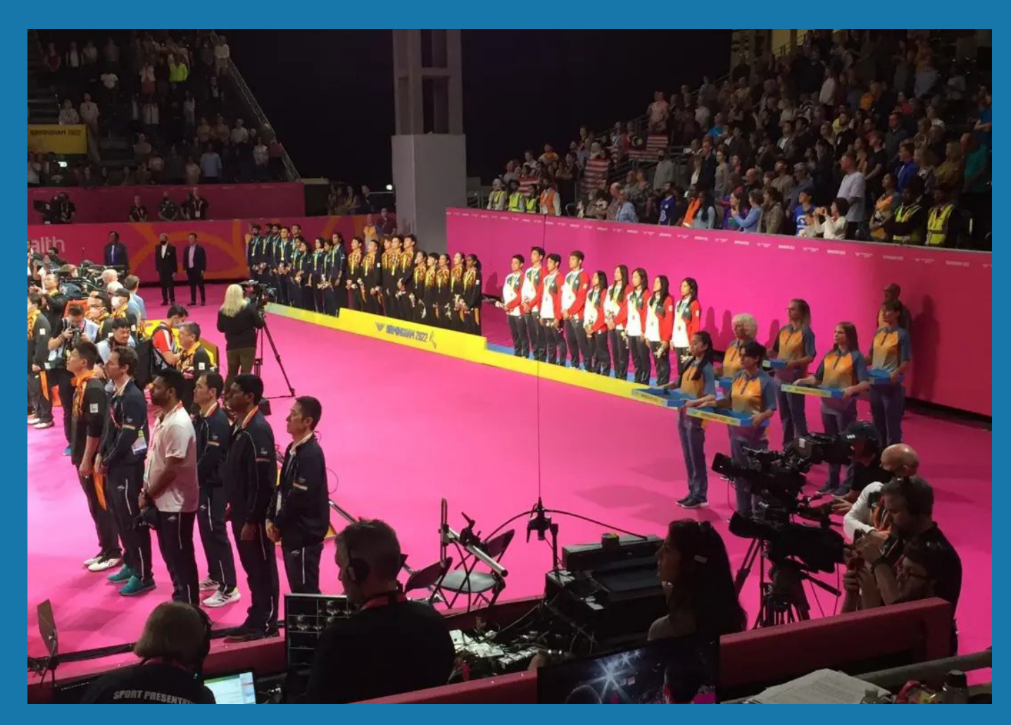
Community champions volunteering for the Commonwealth games at the NEC Arena.